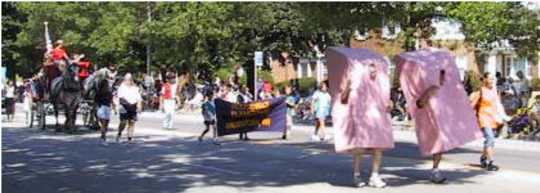
The School-Pak erasers on parade